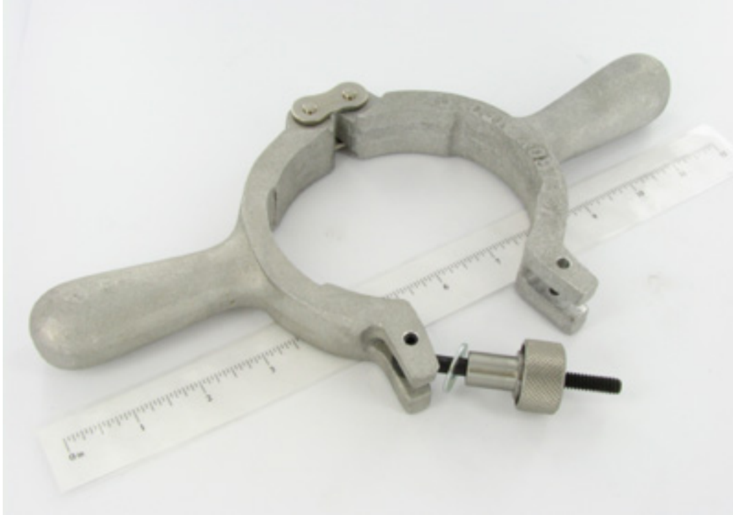
2ips socket ftg holder assy

Part Number: SW07101 2IPS Socket Fitting Holder Assembly