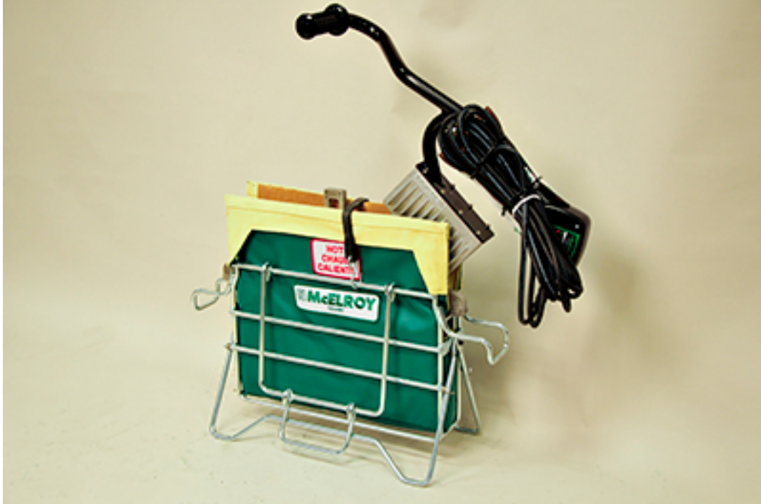
12 220-240,50/60,1 heater assy

Part Number: 1242112 412 220-240V,50/60Hz,1Ph Heater Assembly