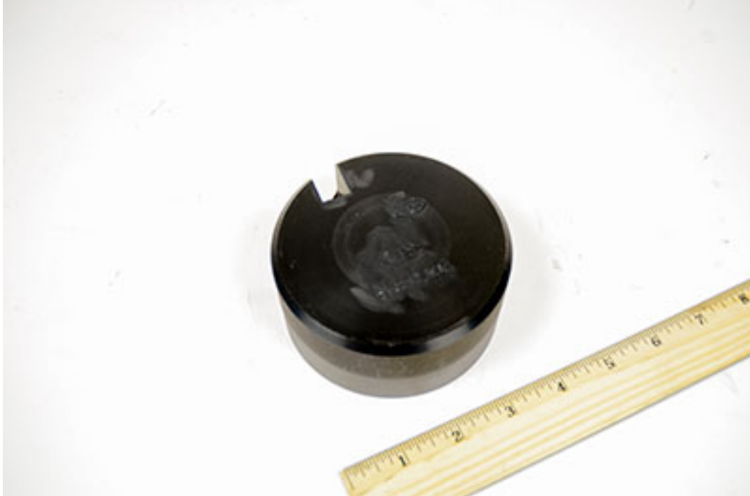
3ips dp gauge&cham tool assy

Part Number: SW08734 3" IPS Depth Gauge & Chamfer Tool Assembly