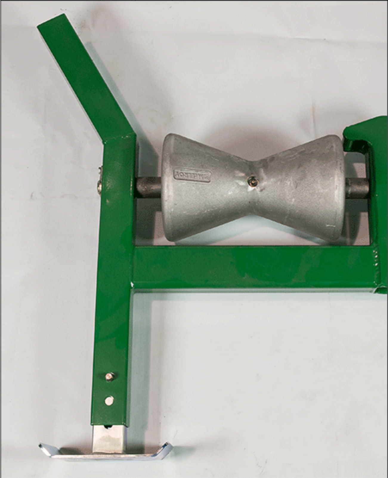
Stationary roller support assy

Part Number: 1876302 Stationary Roller Support Assembly