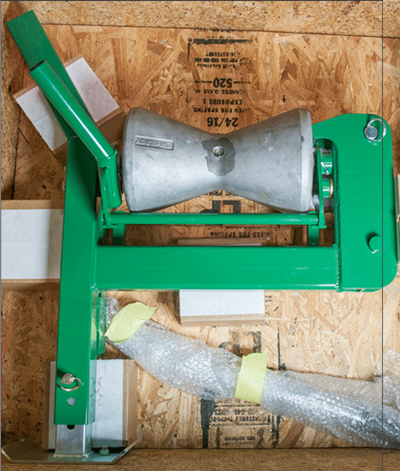
Pivot roller support assy

Part Number: 1876301 Pivot Roller Support Assembly