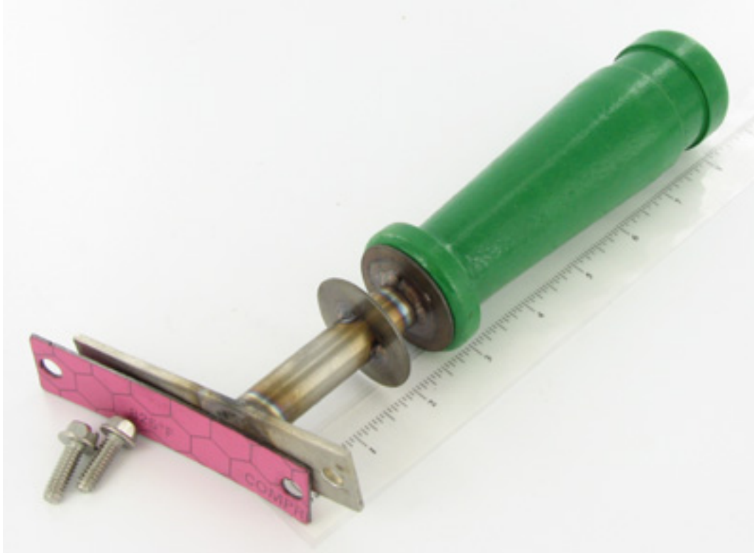
2 htr auxiliary htr handle kit

Part Number: SW02804 2" Auxiliary Heater Handle Kit