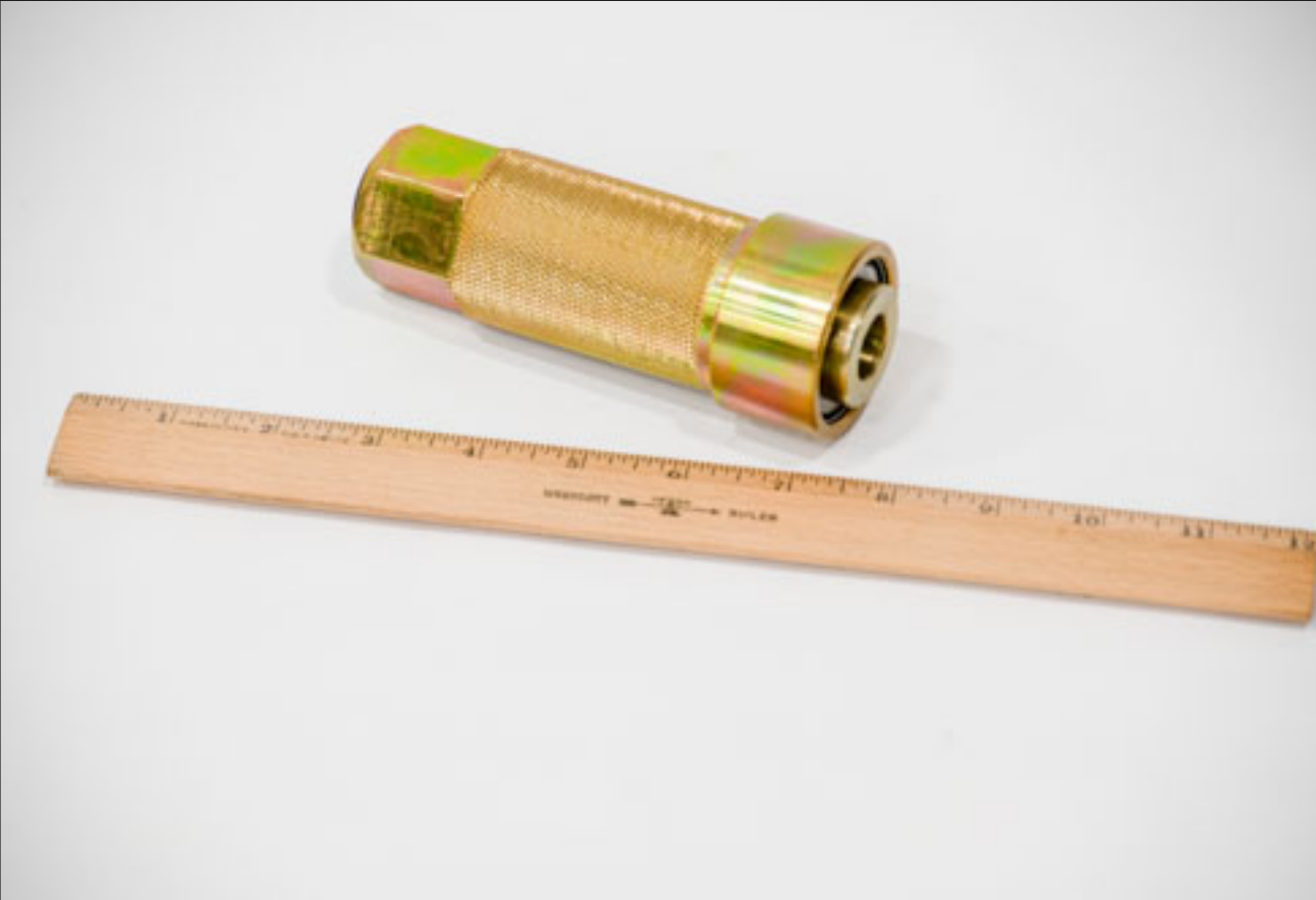
Clamp knob assy

Part Number: A1226203 Clamp Knob Assembly