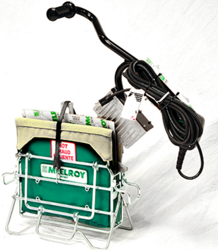
250mm 110-120v,50/60 htr assy

Part Number: T2501004 Obsolete & Replaced by T2516101 (250mm 110-120V,50/60Hz Heater Assembly)