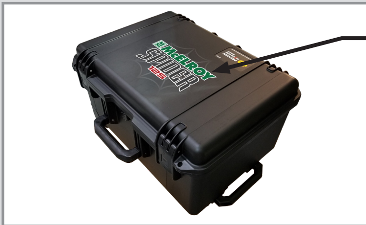
Spider 125 Label