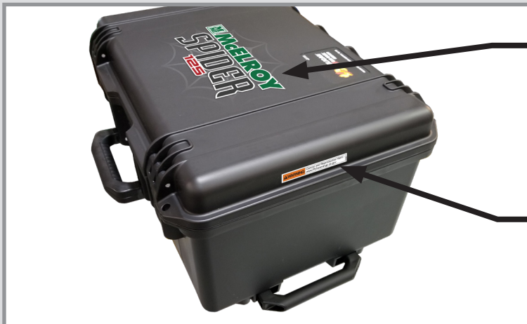
Spider 125 Label